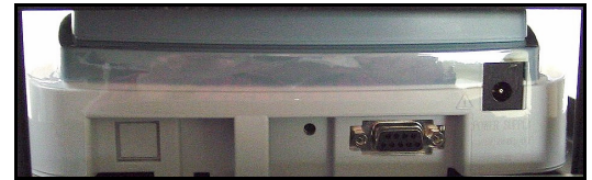
Rear view: RS-232 and printer ports. CE approved (above)