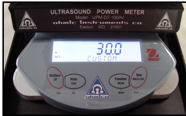
Front Display Panel